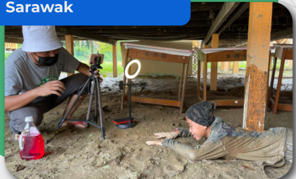
+ SK Luagan, Sarawak