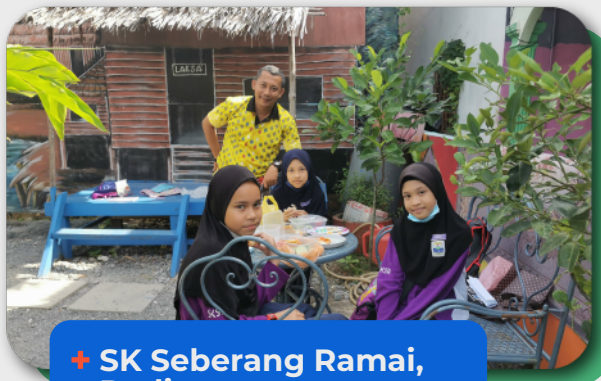
+ SK Seberang Ramai, Perlis